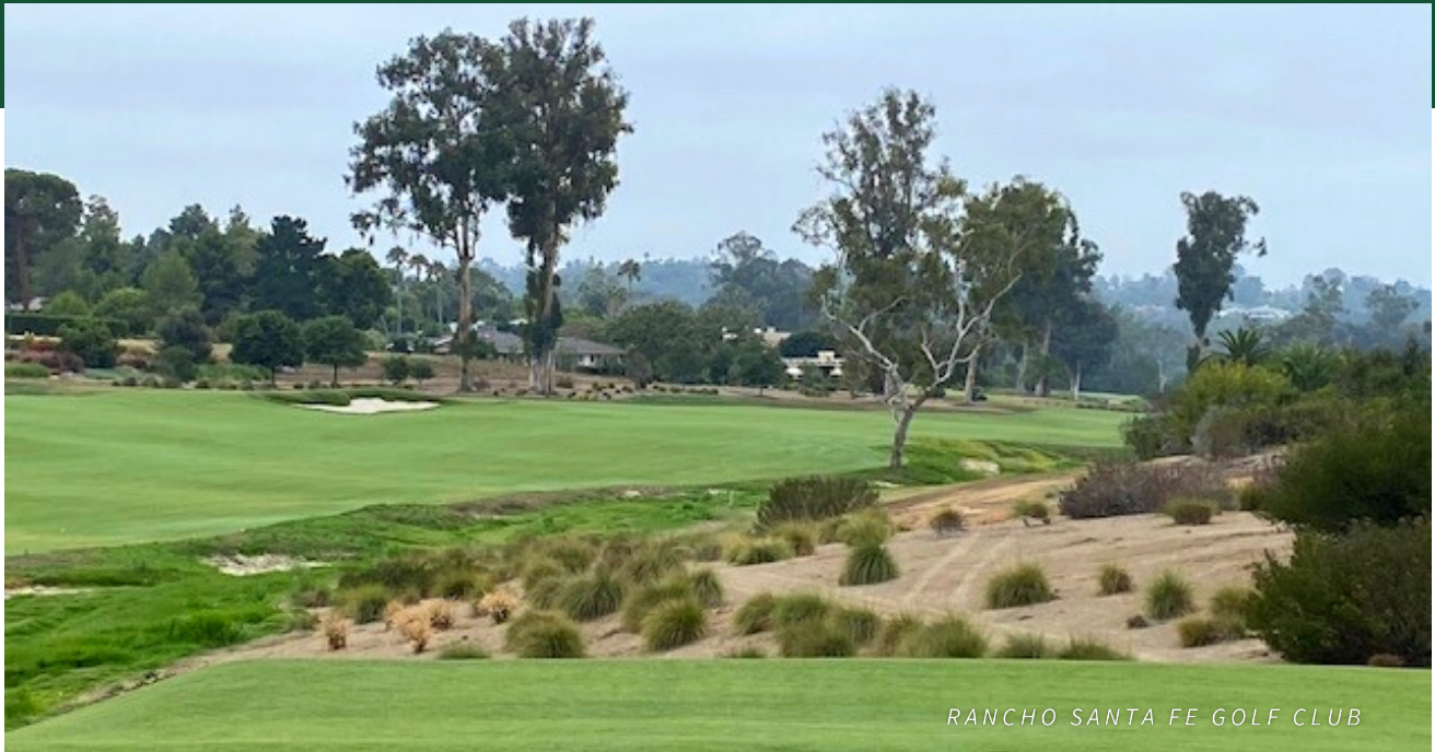
RANCHO SANTA FE GOLF CLUB